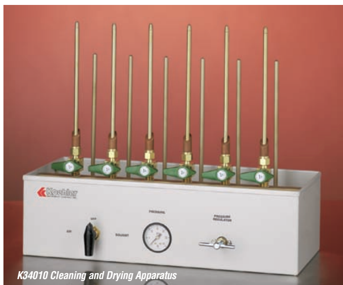
K34010 Cleaning and Drying Apparatus