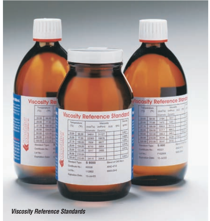
Viscosity Reference Standards

In addition to the many viscosity standards described in this catalog, we can supply custom viscosity standards made specifically to meet your individual needs including high volume supply used for Statistical Quality Check and Statistical Process Control (SQC/SPC) applications.