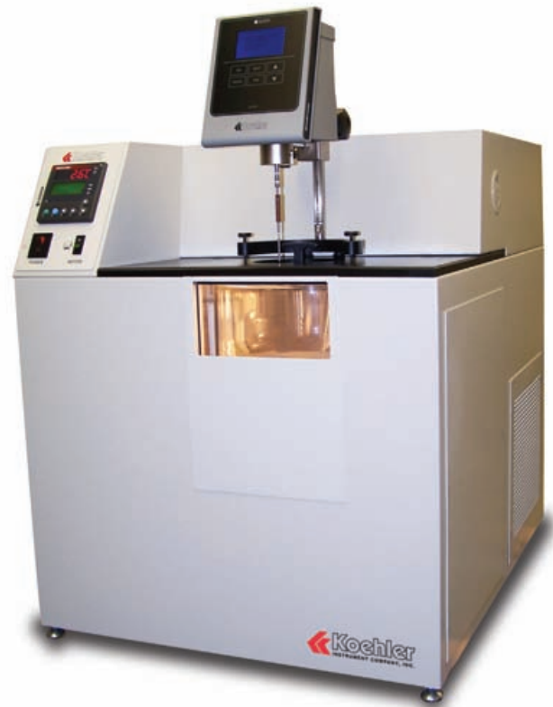
K34715 Programmable Brookfield Viscosity Liquid Bath System