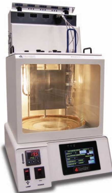
K23702-OS Kinematic Viscosity Bath (KV5000) with K23780-CF Optical Sensor and CF Routine Tube 378-025-C02-OS