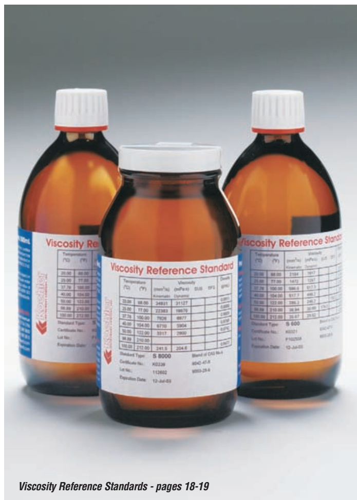
Viscosity Reference Standards - pages 18-19