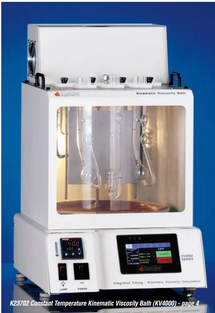
K23702 Constant Temperature Kinematic Viscosity Bath (KV4000) - page 4

Kinematic Viscosity of Transparent and Opaque Liquids