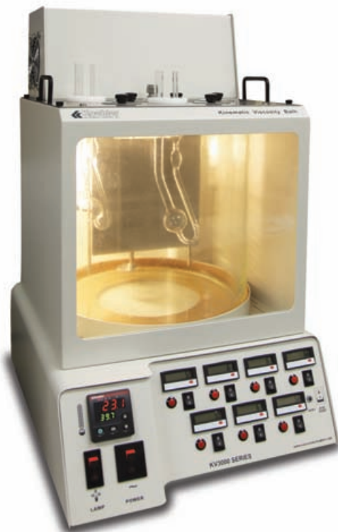
K23700 Constant Temperature Kinematic Viscosity Bath (KV3000)

Included Accessories Port covers, Delrin® (7) Thermometer holder