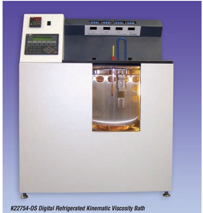
K22754-OS Digital Refrigerated Kinematic Viscosity Bath

Koehler LKV5000 series kinematic viscosity baths with the optical flow detection system provides automatic viscosity measurements of petroleum and petrochemical products. Includes communication and power ports for each optical detection assembly, and can utilize up to four optical assemblies. Optical sensors and viscometer tubes to be ordered separately.