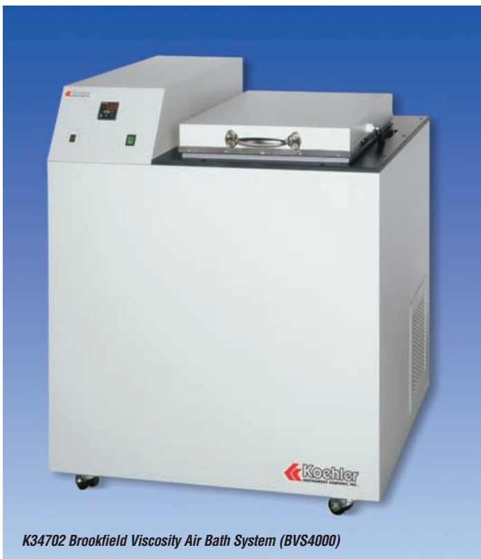
K34702 Brookfield Viscosity Air Bath System (BVS4000)