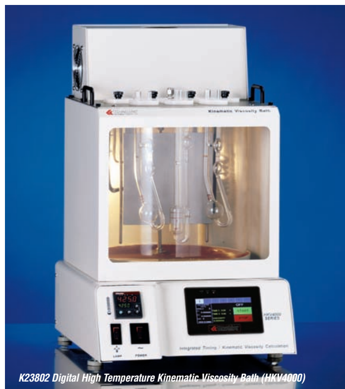
K23802 Digital High Temperature Kinematic Viscosity Bath (HKV4000)

Bath Construction and Safety Features - Bath chamber is a clear borosilicate glass vessel enclosed in an insulated polyester-epoxy finished steel housing. Top working surface has seven 2" (51mm) viscometer ports. Front viewing window assures safe, distortion-free viewing. Microprocessor temperature controller incorporates safety circuitry that interrupts power to the heaters in the event of an overtemperature condition or disconnection of the primary probe. For added safety, an adjustable redundant controller with separate sensor probe interrupts power if an overtemperature situation occurs. An integrated low-liquid sensor prevents operation of the bath if the bath liquid is not filled to the proper level and cuts off power should it fall below during operation. Both overtemperature and low liquid level circuits will latch and prevent further operation of the bath until the fault is removed.