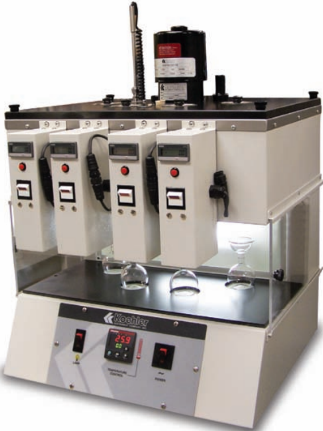
K21414 Saybolt Viscosity Bath (SV4000) with K21404 Auto Viscosity Timers