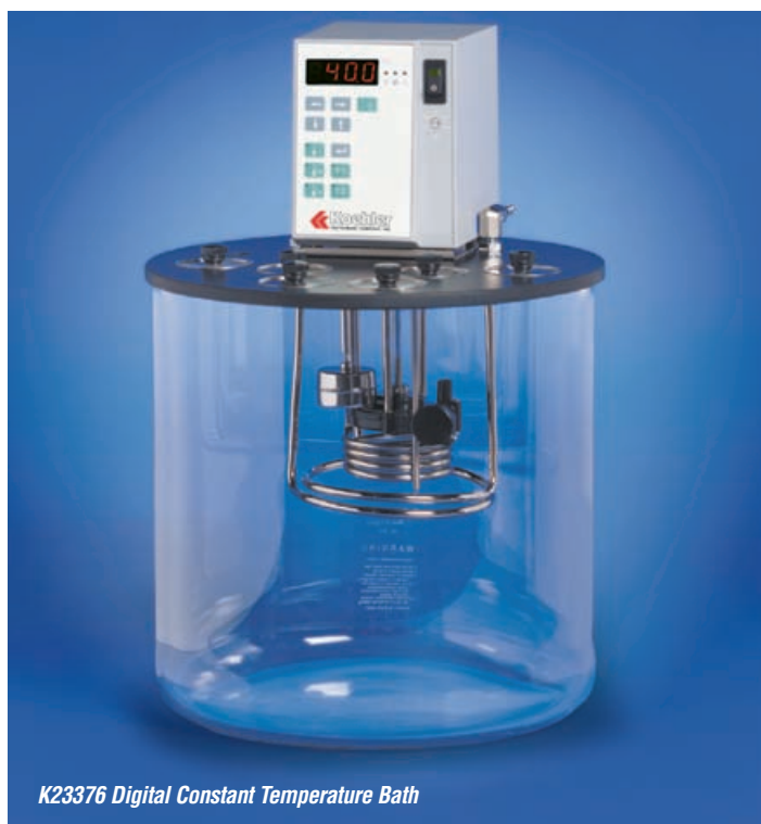
K23376 Digital Constant Temperature Bath