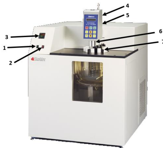
Figure 1. Instrument Descriptions