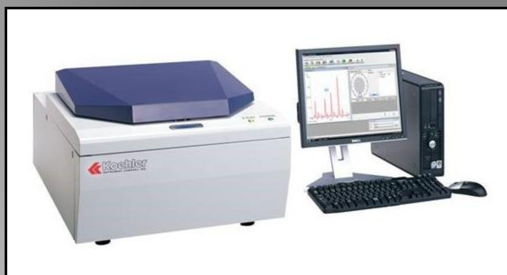
Figure 1: EDX3000 Benchtop EDXRF Elemental Analyzer

For any instrument intended to be used to measure gasoline properties, it needs to meet the standards set forth by 40 CFR 80.47. The reason for this is that the instruments need to be able to meet a certain precision and accuracy criteria set by the regulation in order to give reliable measurements on the gasoline. The Koehler EDX3000 is the instrument that not only follows ASTM 7220, but is the exact instrument that refiners can use to meet EPA standards.