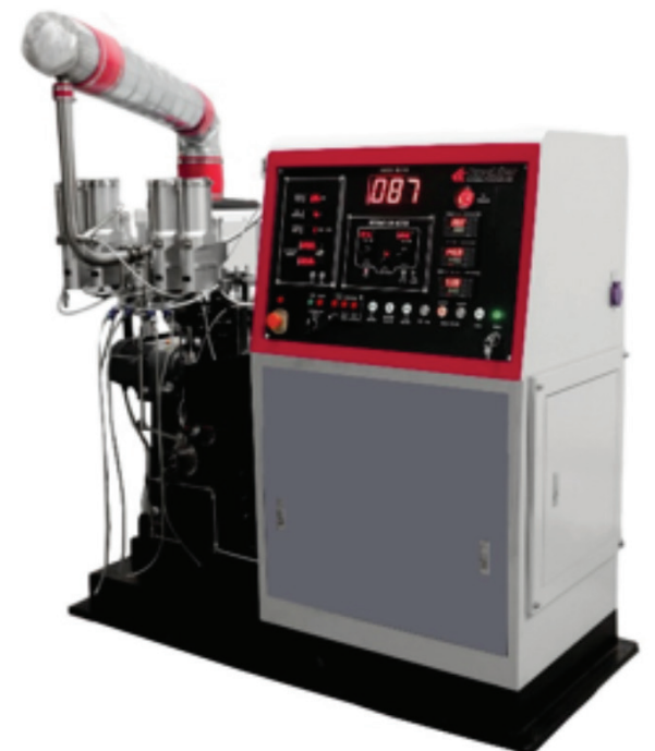
Figure 1: Combination Octane Rating Unit Engine for RON and MON determination of Gasoline

Unfortunately, the development of fuels to avoid knock has been hindered by the octane number tests. The octane number test quantifies a fuel's propensity to knock; fuels in-turn are blended to achieve certain octane requirements. These tests compare the antiknock performance of a fuel to a set of standard reference fuels at two set test conditions – the research and motor condition. The research test condition, which provides the research octane number (RON), represents engine temperatures and pressures that are comparable to modern engines. The motor test condition, which provides the motor octane number (MON), uses significantly higher temperatures to represent more demanding test conditions. Numerous studies have shown that while the RON still captures antiknock performance in modern engines, the MON does not. In fact, numerous studies have found that if two fuels have the same RON, the one with the lower MON will have better antiknock performance [9].