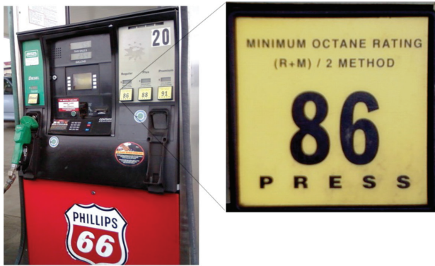
Figure 2: The change in fuel Octane Number with time. Note that there has not been any significant increase since 1955.

The underlying issue is that the tests have not been significantly updated since 1928. When the tests were developed, the average fuel octane number was considered 50, with 100 being the holy grail of fuels. Soon after the development of the tests, advancements in catalytic cracking technology resulted in higher octane fuels (around 90) becoming common-place [11]. However, the octane numbers of fuels have not significantly increased in the past 50 years. Since society typically equates the octane scale to a grade scale, a 90 octane fuel equates to an A, so there is no innate push for higher octane fuel. However, a high octane number simply indicates that a fuel behaves very similarly to iso-octane, a fuel known as having good anti-knock properties. Many other fuels have significantly better anti-knock properties, especially in the range of engine conditions relative to knock in modern engines.