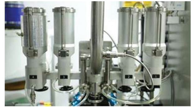
Figure 3: Carburetor Bowl / Float Chamber Assembly for Combination Octane Rating Unit Engine

Studies", SAE Technical Paper 2001-01-3584, 2001. doi: 10.4271/2001-01-3584